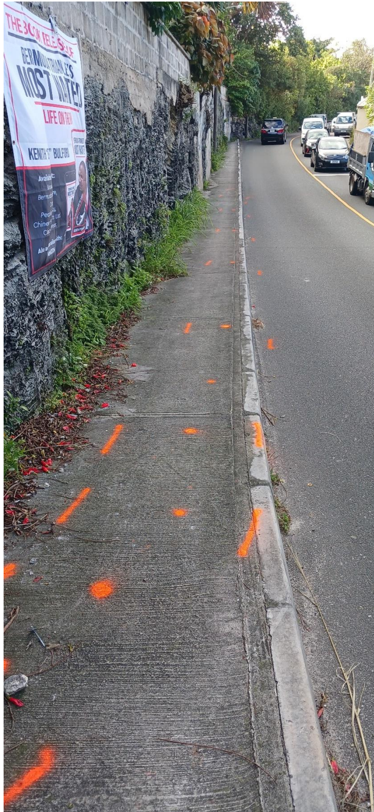
Figure 1 - Belco Markings from nearby pylon. Central dots indicate the expected cable path, but may fall within inner and outer boundaries which are also marked.