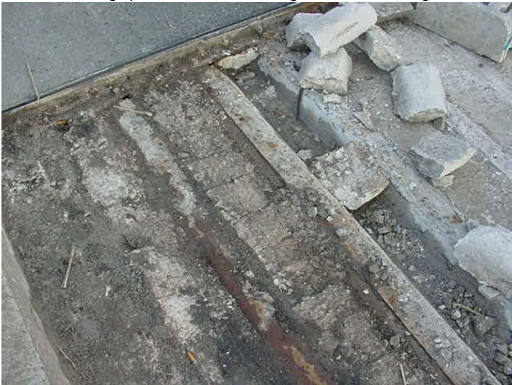
Photograph 3 – Chunks of concrete during removal, approx. 8" long