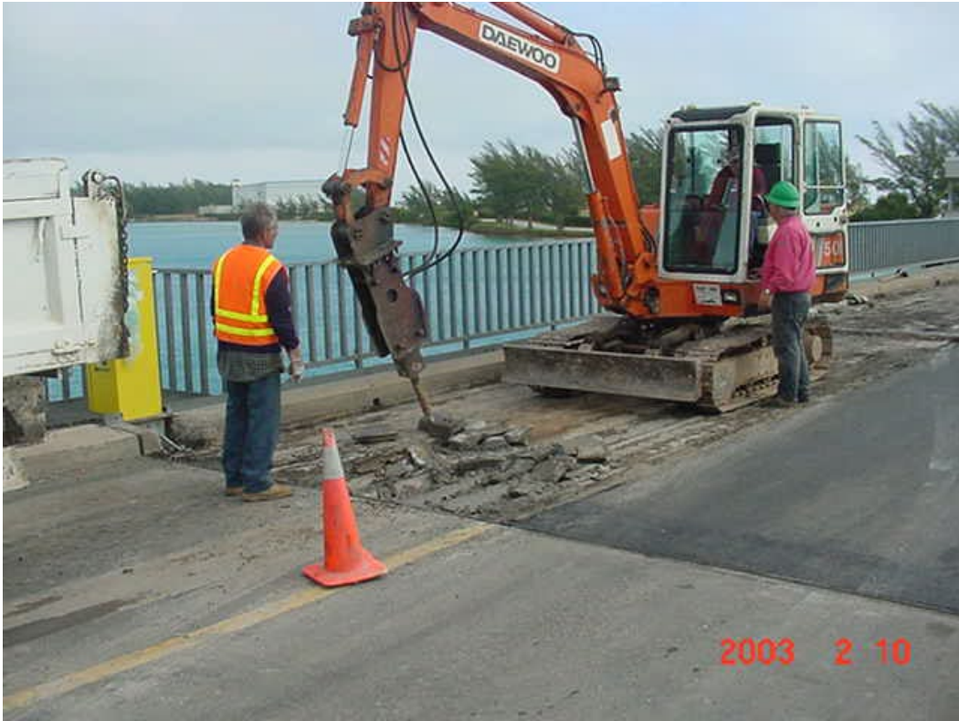
Photograph 2 – Excavator removing concrete from troughs