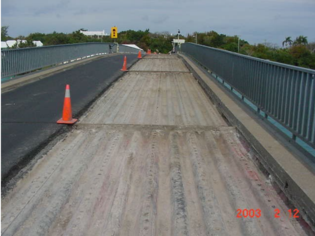
Photograph 6 – Bare troughing