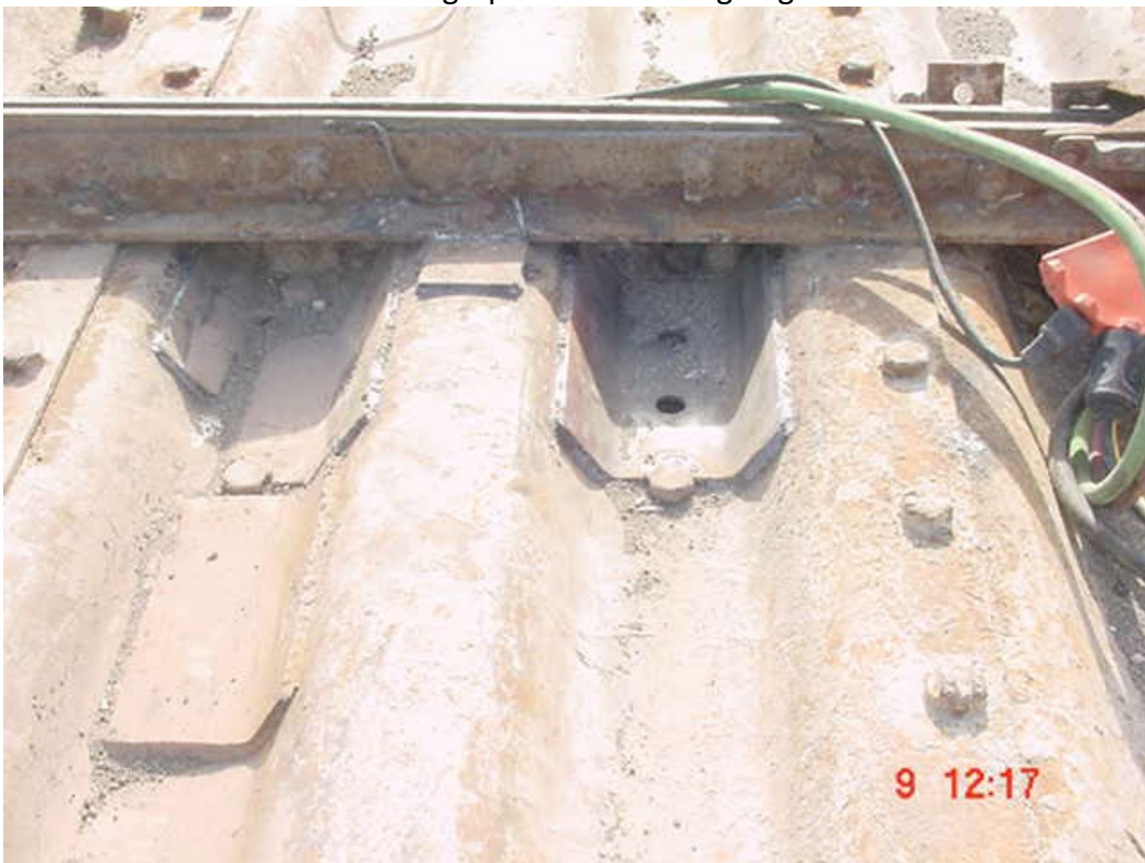
Photograph 7 – Span end plates