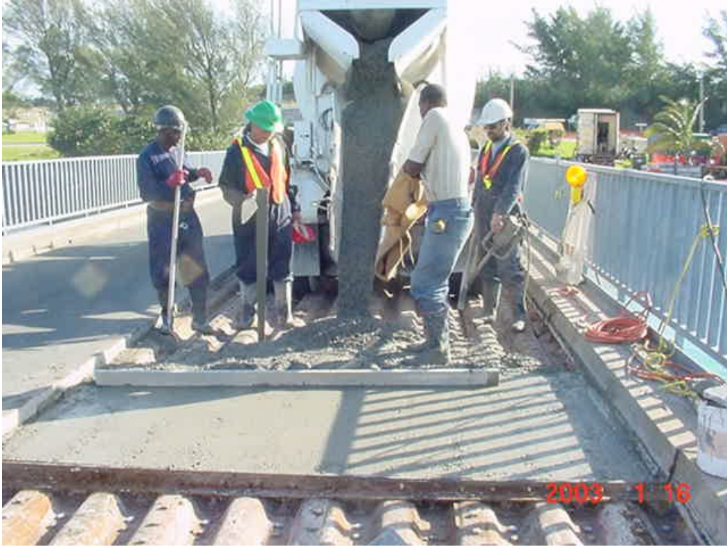
Photograph 8 – Concrete reinstatement