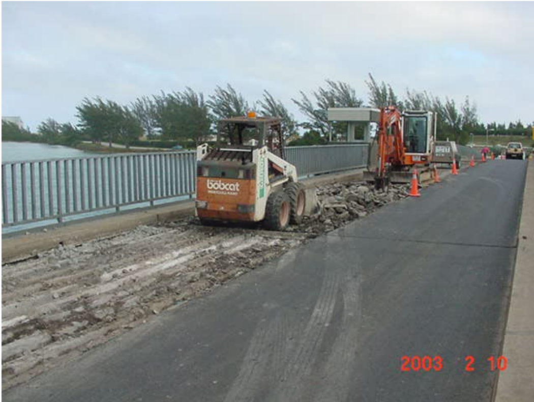
Photograph 4 – Concrete removal