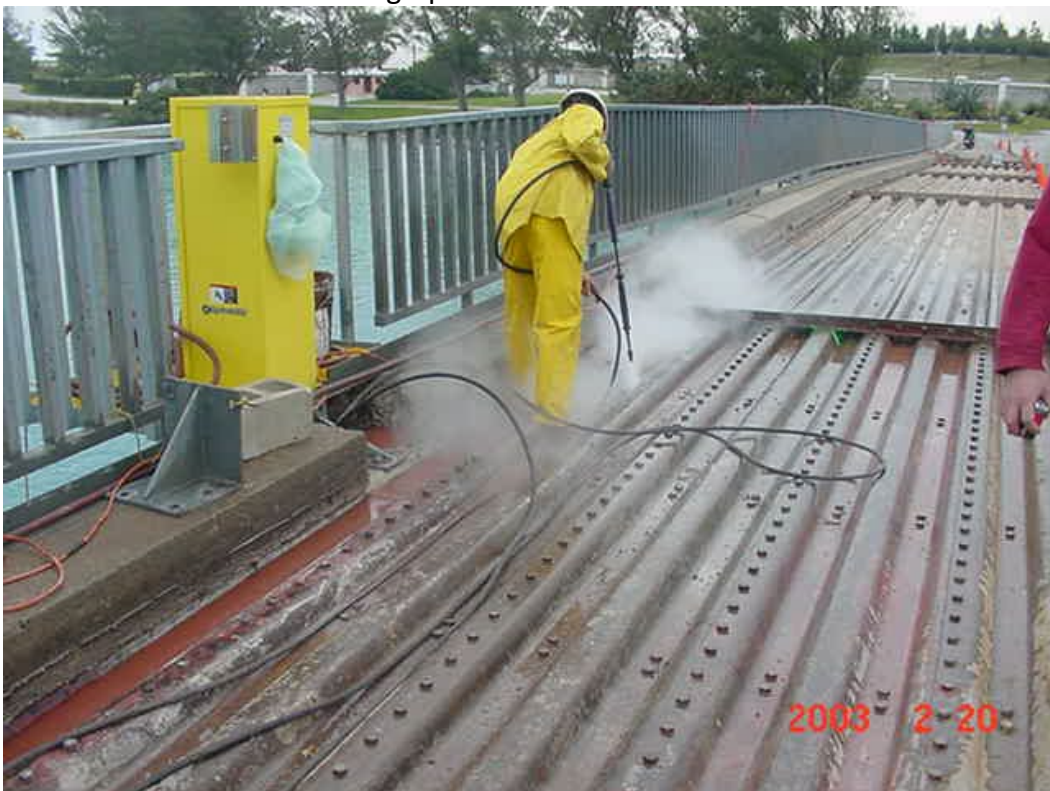
Photograph 5 – Deck cleaning