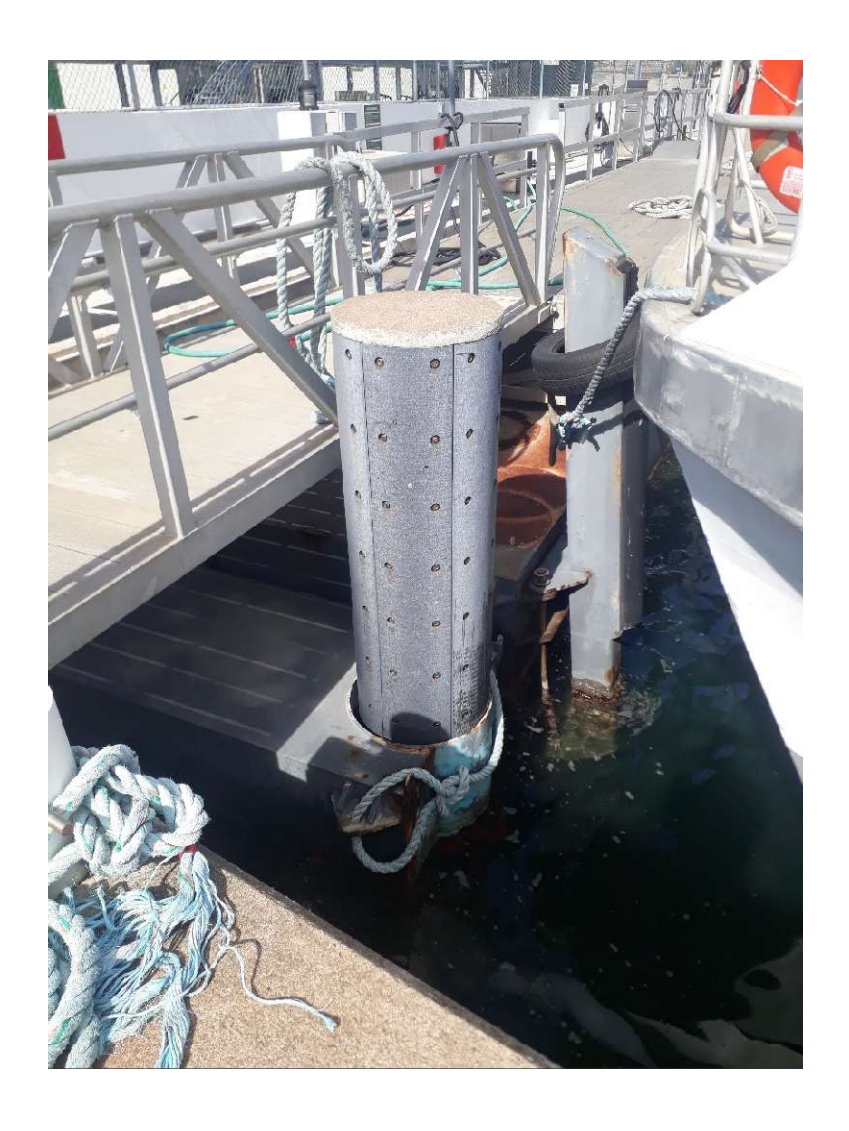
END OF PART 2