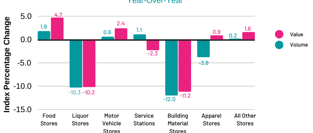
Figure 2 September 2024 Retail Sales Value and Volume Indices Percentage Change by Sector Year-Over-Year

Three of the seven sectors recorded year-to-year sales volume and value index decreases during September 2024. In value terms, retail sales increased to an estimated $100.7 million, which represented a 1.4 per cent growth in sales value year-to-year. Excluding Sundays, there were 24 shopping days, one fewer than in September 2023.