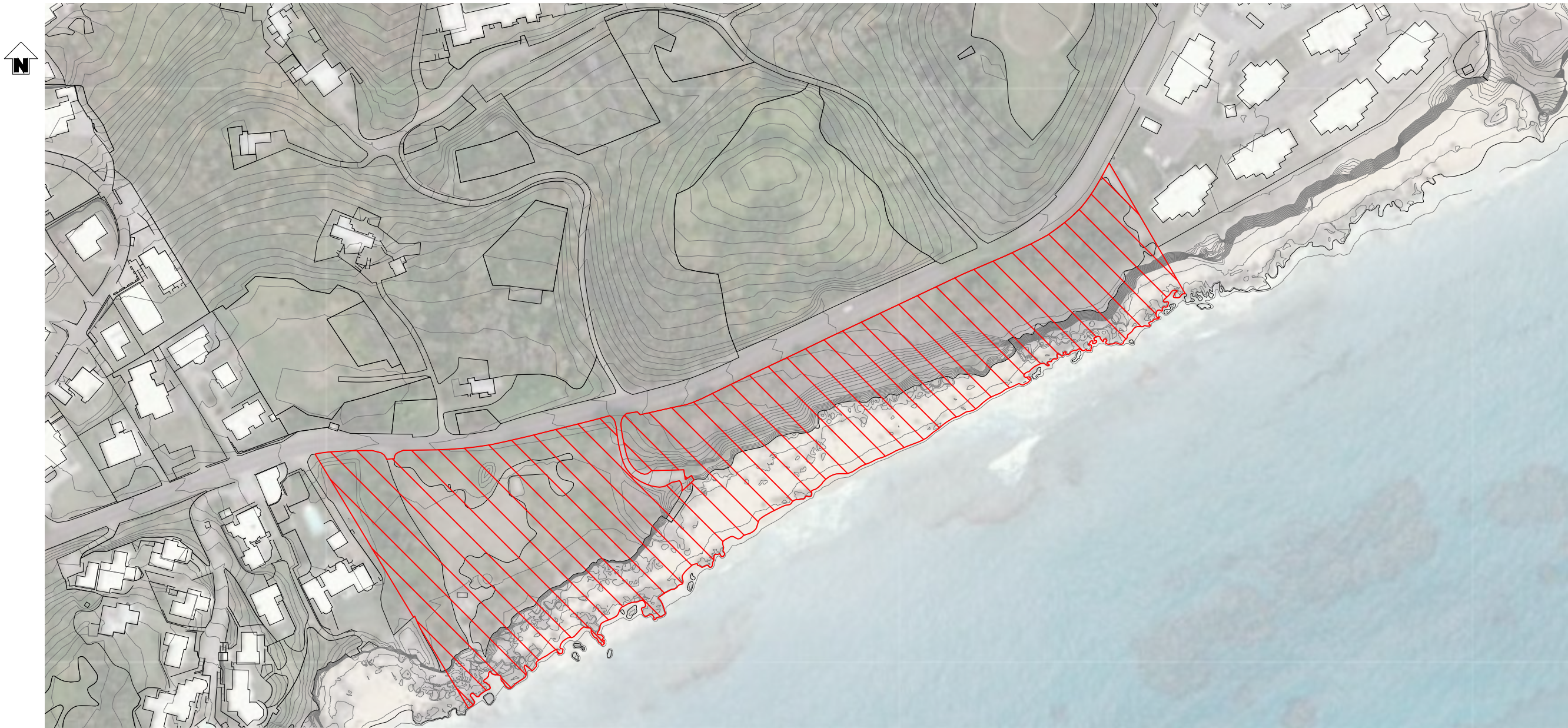
AREA IDENTIFIED FOR MANAGEMENT 1:1000