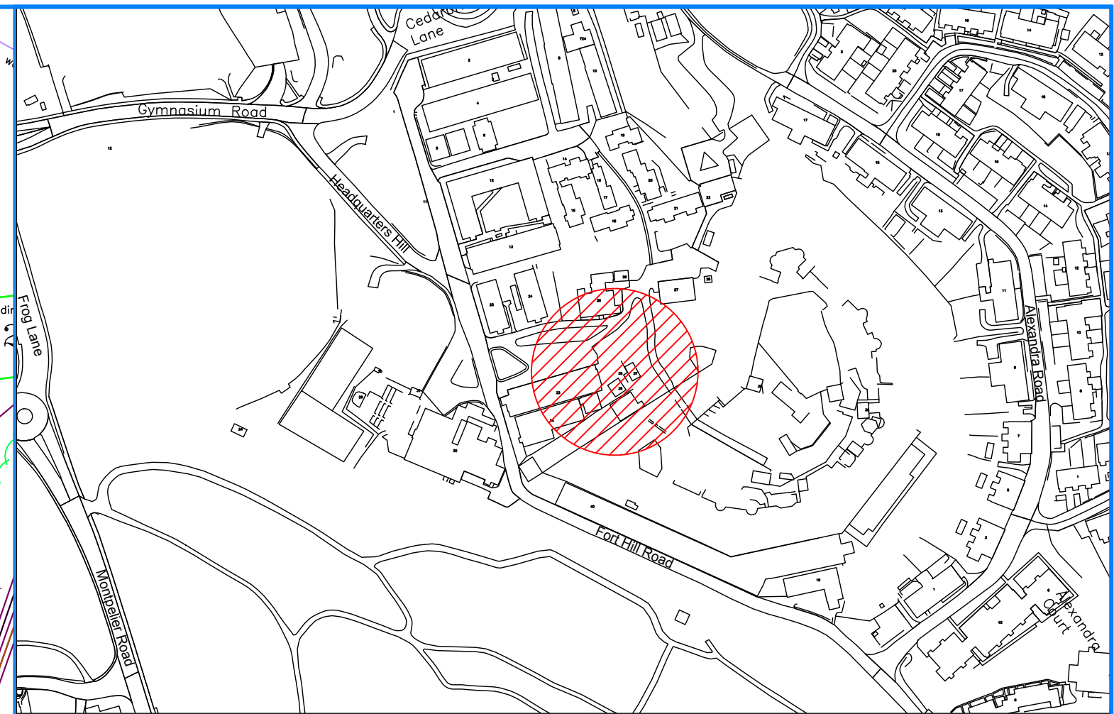
Location Plan Scale 1:2500