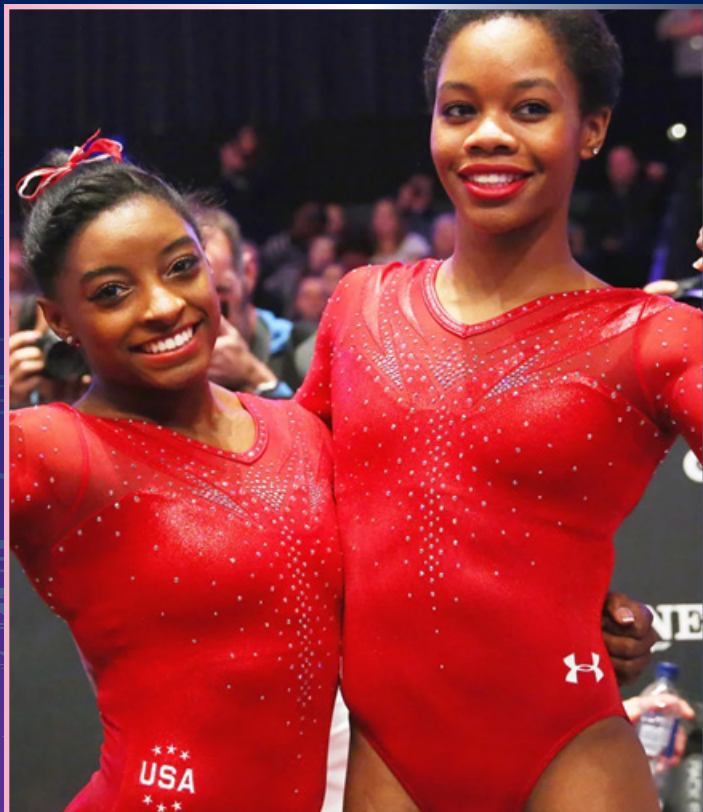
Simone Biles and Gabby Douglas

Visit our website to see what is happening in gymnastics https://gymfedbda.bm/