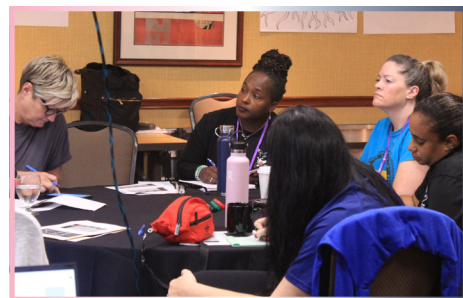
BRFU Woman's Forum