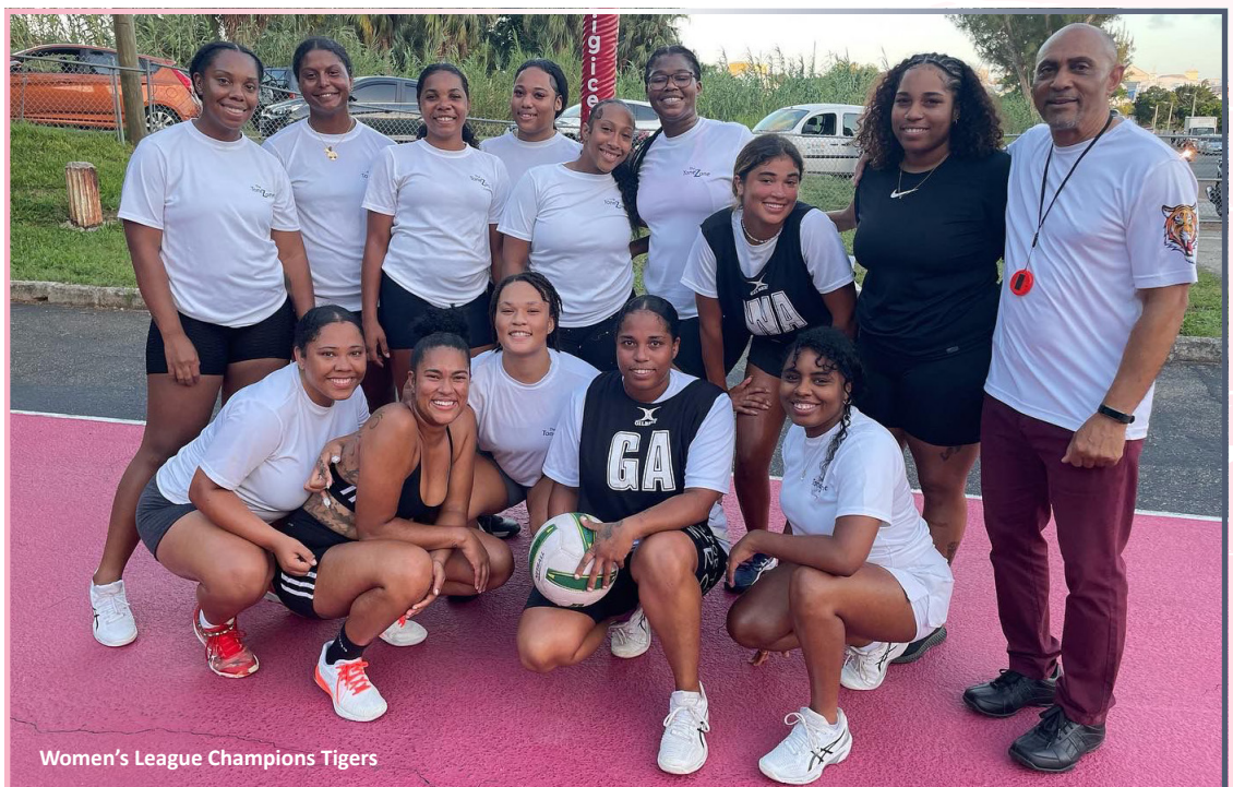
Women's League Champions Tigers