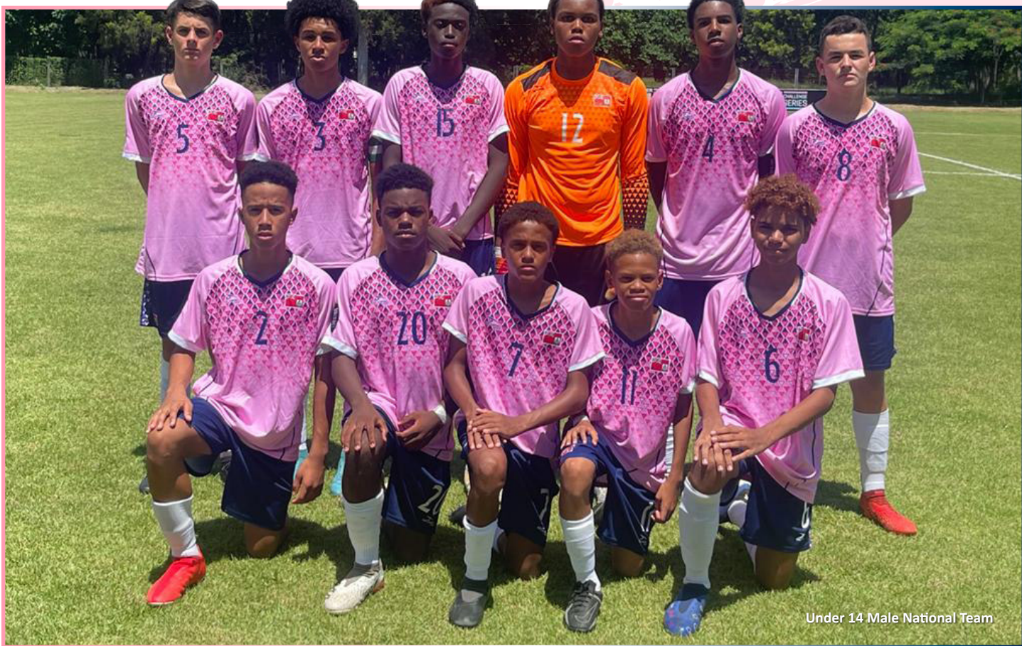
Under 14 Male National Team