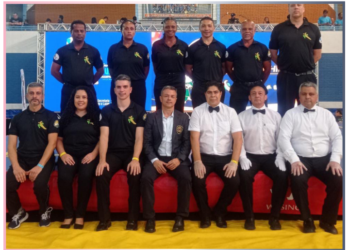
San da officials at 13th PAWC