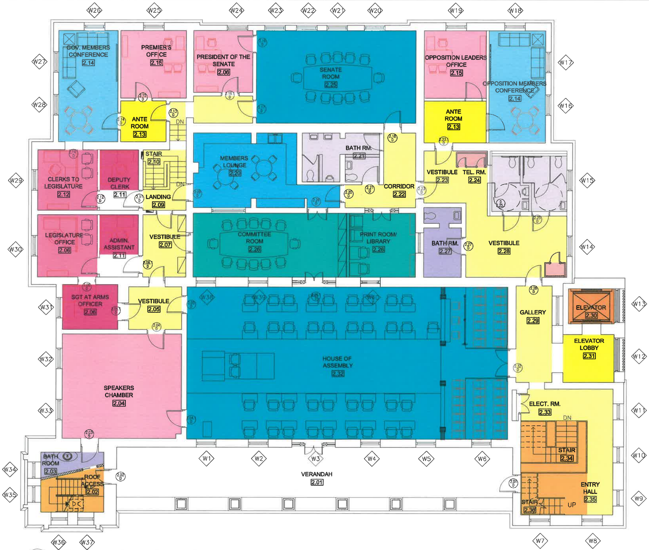
1 PROPOSED SPACE PLANNING - UPPER FLOOR PLAN SK-101 SCALE 1/8" = 1'-0"