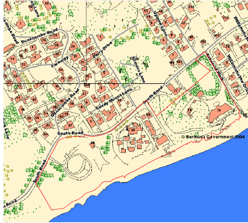
LOCATION PLAN NTS GRID E744/232