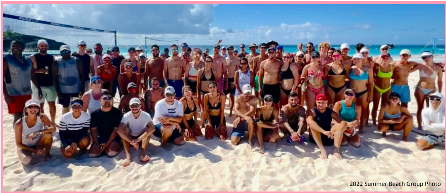
2022 Summer Beach Group Photo

September saw the conclusion of a successful summer season. This summer saw our outdoor beach season go back to normal with four weekend beach tournaments taking place and six weeknight summer leagues, including coed recreational 4s leagues, coed competitive 4s leagues and men's/women's competitive 2s leagues. The End of Season (EOS) party took place at Dockside's on Saturday, September 17 th where winners of each league were presented with their prizes from our sponsors, BDA Spirits and Dockside's, and all participants were welcome to join in for drinks, food and fun to celebrate the season's success. This